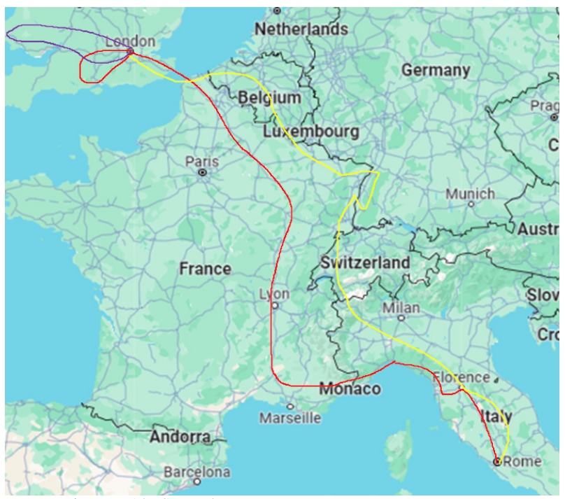
Europe Trip. June 14 - September 7

After 4 years of no traveling, except for the move from New York to Sarasota in 2021, we decided to plan a long and complicated 3 month trip to Europe to reconnect with our friends (and memories) in the Old World. It proved to be epic, and demonstrated how doing things the slow way yields the best results. The pace was mostly dictated by Robert's old car which could not be pushed much beyond 90 Km/h (56 mph). Photos of the trip are on Robert's Facebook page. Here is a map of our trajectory through Europe: