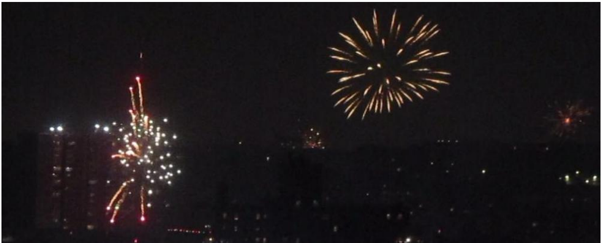
View from our window on July 4th

As July 4 th approached, we noticed that hundreds of people were venting their lockdown frustration by igniting fireworks for hours on end, often late into the night, and weeks before Independence Day. The night of the 4th saw one of the most spectacular city-wide fireworks extravaganzas I have ever seen in New York!