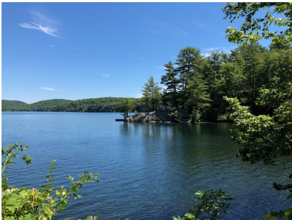
Sterling Forest, June 25

One of our neighbors recommended to us a day trip to Sterling Forest, about an hour drive out of New York City. It was refreshing to rediscover natural landscapes. We were lucky to go there before the hordes of city dwellers discovered it.