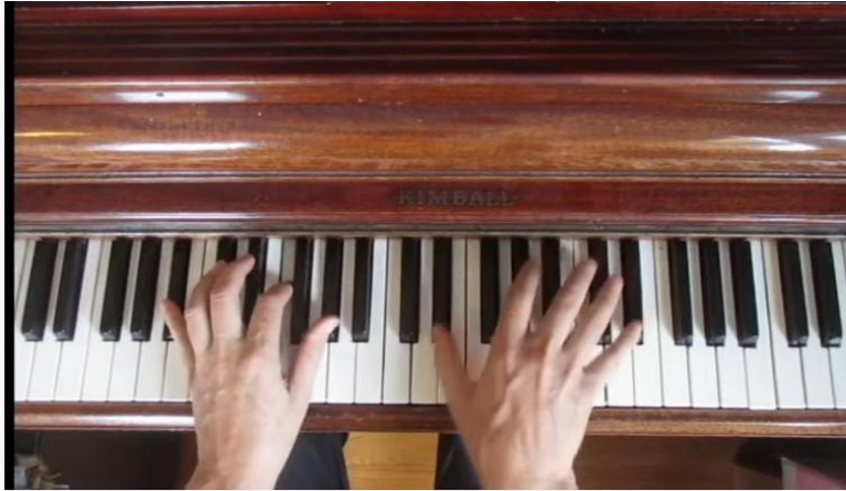
Mutattr, by Barry Harris