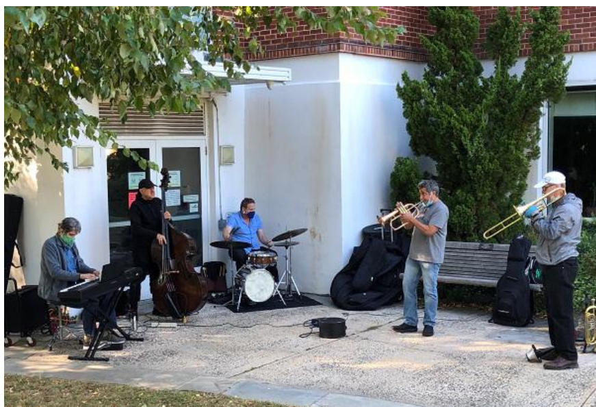
Hastings-On-Hudson Library entrance, September 20

September weather was warm and pleasant, and musicians were now allowed to play outdoors. Robert was able to play every Sunday afternoon in a jam session at Hastings-On-Hudson, which provided motivation to practice and learn new tunes.