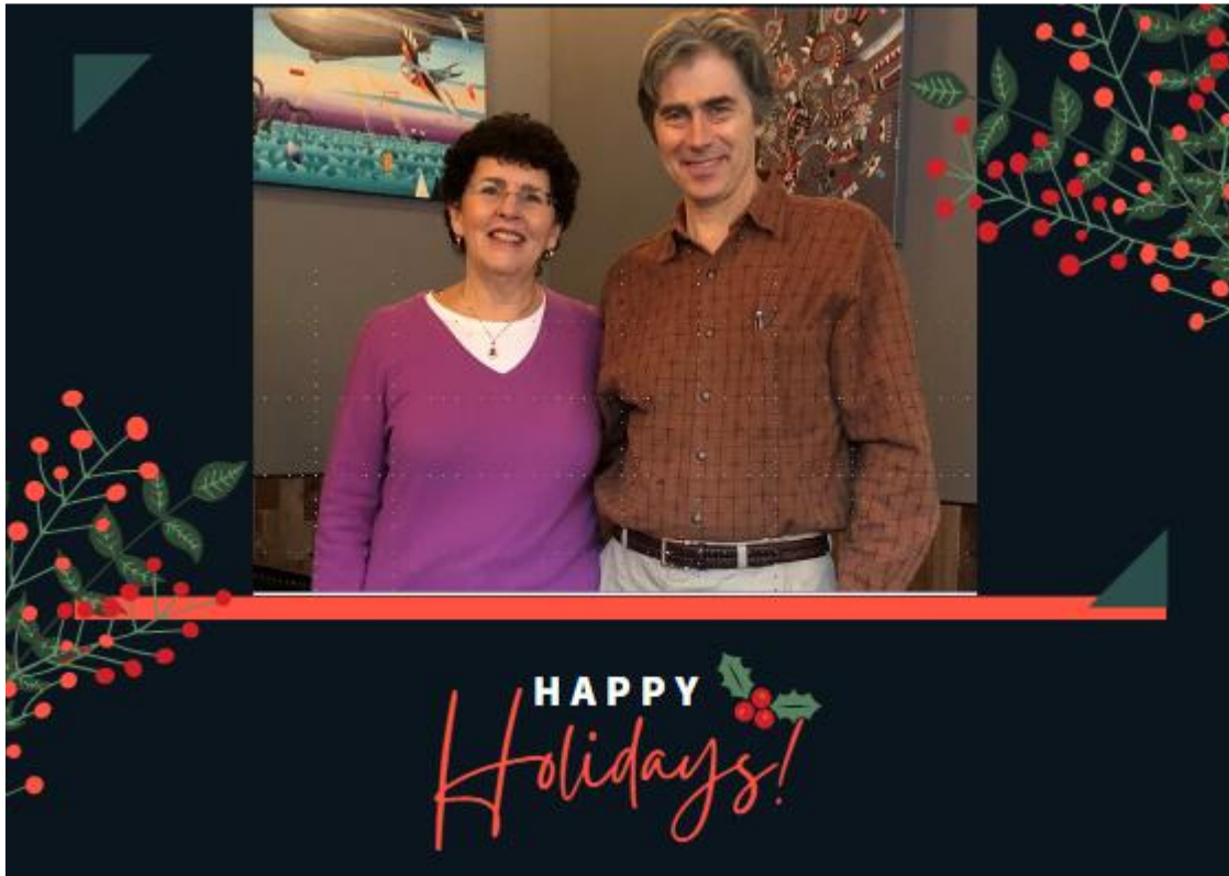
Soleluna Restaurant, Dec. 1, 2019

What to say about 2020? A sad disaster from the point of view of public health management, but also the discovery of inner strength for many of us. We still remember when we went shopping in March and employees were forbidden to wear masks because it would ‘spook’ customers. We’ve come a long way since then. No wonder so many people are distrustful of the Center for Disease Control.